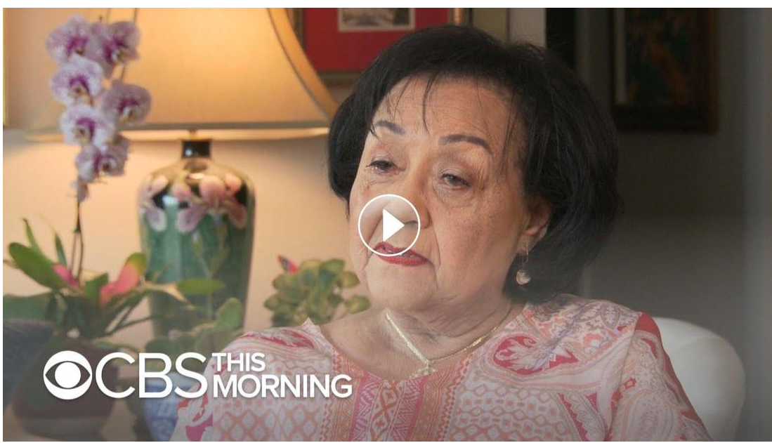
Inside the nation's oldest female, African-American-run construction management firm