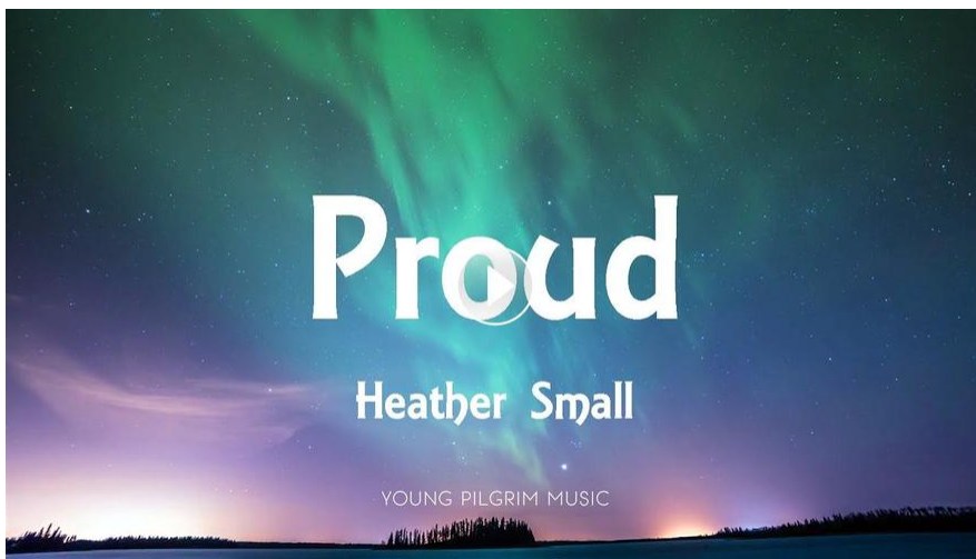
Proud by Heather Small (lyric video)

"Natchez, Mississippi, once had more millionaires per capita than anywhere else in America, and its wealth was built on slavery and cotton. Today it has the greatest concentration of antebellum mansions in the South, and a culture full of unexpected contradictions. Prominent white families dress up in hoopskirts and Confederate uniforms for ritual celebrations of the Old South, yet Natchez is also progressive enough to elect a gay black man for mayor with 91% of the vote...." Click the picture to learn more or to purchase the book!