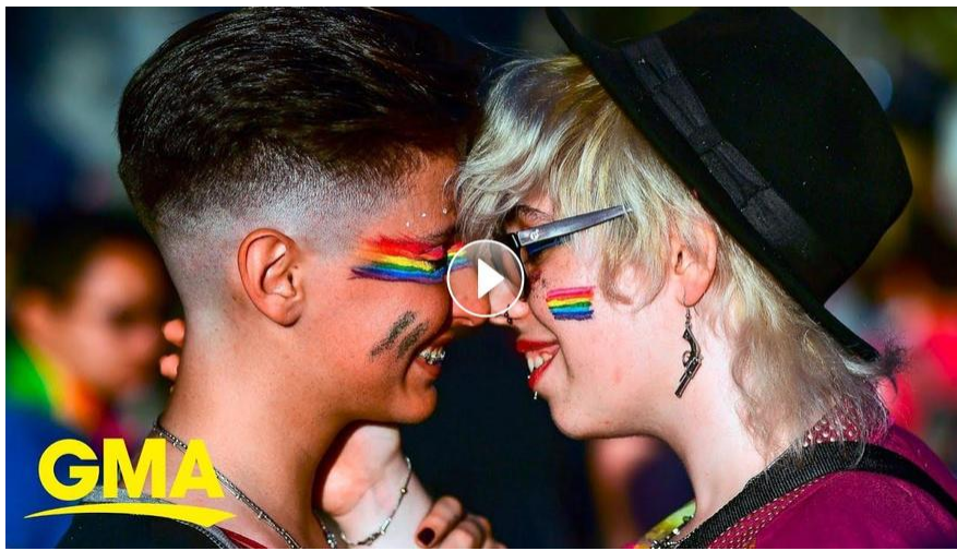
The Story of the Pride Parade - GMA